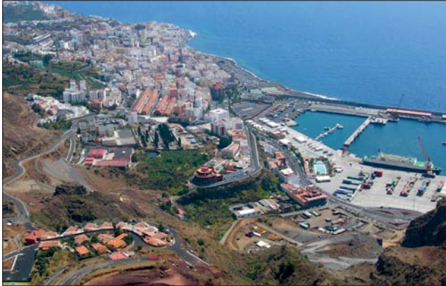
La Palma is a delightful alternative destination

▲ La Isla Bonita, La Palma, have just started a new drive to attract more British tourists to their island, more commonly home to visitors from German shores. While other islands have taken a share of the British market over the years, La Palma has remained off most UK tour operator's lists until very recently. However with the inauguration recently of two flights weekly from London and Manchester, courtesy of Thomson, the local authorities are hoping that more and more Britons will want to discover the particular delights of the island. Tourism councillor Beatriz Páez told local paper Diario de Avisos that "while we have to continue to work to strengthen the German market which we don't want to lose", it was essential to explore new promotional opportunities, for instance English tourism. She added that promoting the island was much more than simply taking a stand at a trade fair, but meant ongoing contacts with