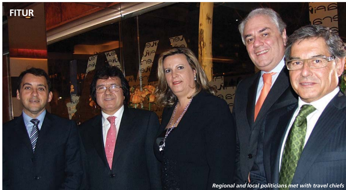
Regional and local politicians met with travel chiefs