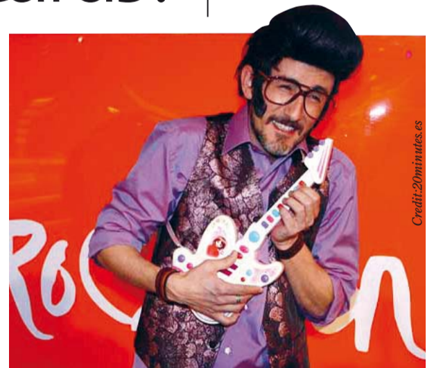
Chikilicatre, the stupidest song ever?

However, Spain's national broadcaster TVE, which is responsible for the final choice of song, fearing the country's reputation could be further damaged if Pezón Rojo get through has already disqualified many entries. The combination of Dustin the Turkey (Ireland) and Chikilicatre led many pundits to see the 2008 Eurovision Song Contest as hitting the depths in terms of content.