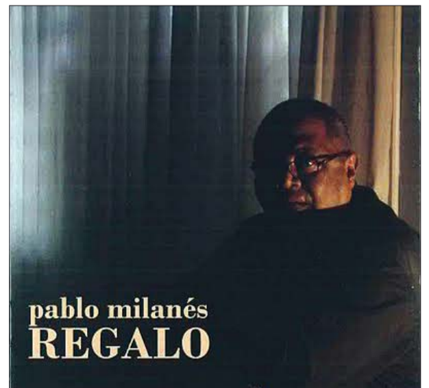
Pablo Milanés' latest album Regalo inspires the tour

Milanés, who has been performing for over half a century, had to call a halt to a concert in Buenos Aires after taking ill but his entourage say he was suffering from a bout of flu and would continue his tour. He last played in the Canaries in 2008 in a joint concert with fellow Cuban Chucho Valdés.