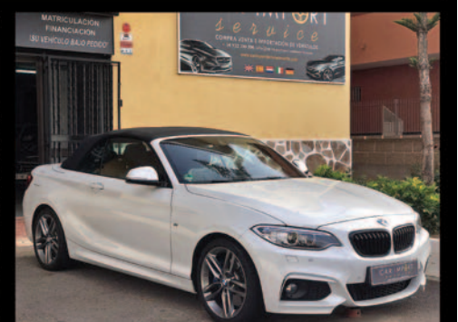
BMW 220 DIESEL M