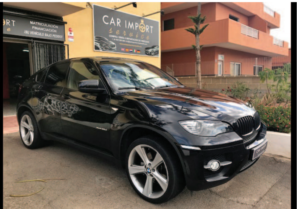
BMW X6 4.0 Diesel PACKET SPORT 2012

Monday - Friday: 9.30am - 2pm and 4pm - 7pm Saturday: 9.30am - 2.00pm