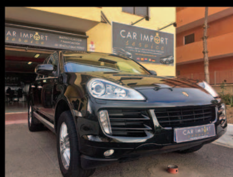
PORSCHE CAYENNE 3.6 V6