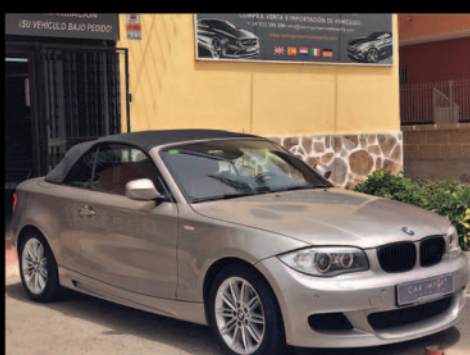
BMW 120i CABRIO M