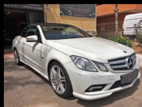
MERCEDES E350 CDI AMG