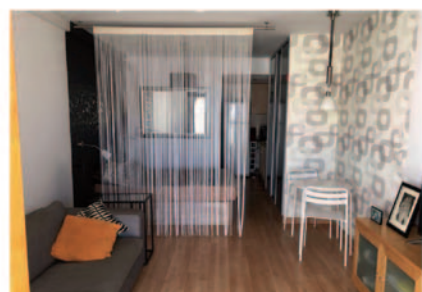
Los Cristianos - €102.000 Beautiful studio in PORT ROYALE complex with Pool.