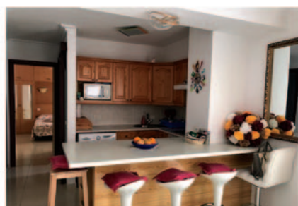
Los Cristianos - €155.000 One bedroom apartment in PORT ROYALE , ground floor