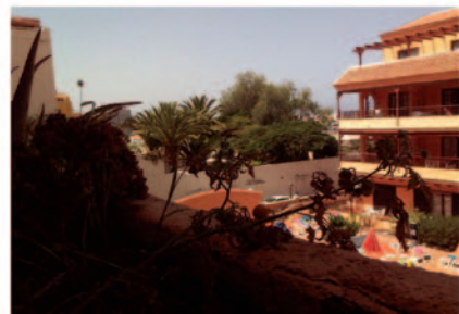
Los Cristianos - €147.000 One bedroom apartment in LOS ALISIOS , Poolview and quiet location.

Within the complex there are lovely garden areas, a play park, restaurant and swimming pool, everything you should need while holidaying in this Paradise Isle.