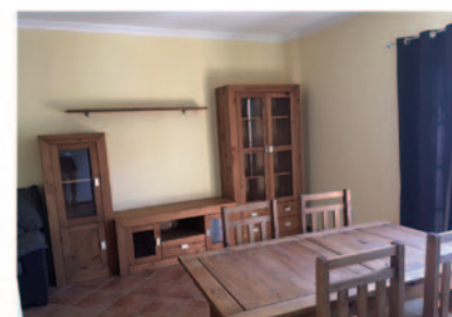
Buzanada - €98.000 Two bedroom apartment, fully renovated, one bathroom.

lagunasur.es / carmelo@lagunasur.es / 628 842 913