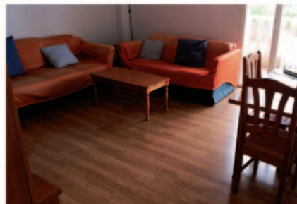
Los Cristianos - €252.000 Three bedroom apartment, 2 bathrooms with seaview in VISTA HERMOSA .