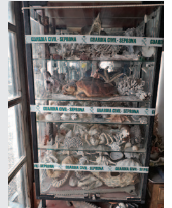
↑ A macabre collection of supposedly protected species

Thanks to a tip from a private individual, officers of the Guardia Civil Seprona Environmental Protection Unit began investigating a 65-year-old man from San Miguel de Abona. On his finca at Aldea Blanca, several animal fragments were seized which are particularly protected as endangered species by the international Convention on International Trade in Endangered Species of Wild Fauna and Flora (CITES). Since the owner could not prove that he had obtained these specimens legally, a complaint was filed against him. The officers seized the prepared body and the shell of a hawksbill turtle, as well as a green sea turtle, various large corals, numerous crustacean shells, several shark skeletons and a seahorse, in fact a complete showcase filled with 'marine prey'. In addition, several pieces of wood from Africa and South America were confiscated. The man was charged with violating the Convention on International Trade in Endangered Species of Wild Fauna and Flora. ■