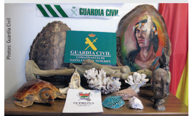
↑ Whole turtles, seahorses and corals were seized