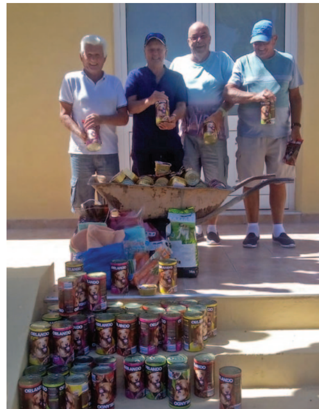
↑ Kind residents of Los Geranios apartments, Los Cristianos, made a fantastic donation of dog food to the Acción del Sol refuge

Please do call us on 664 321 219 or 602463242 between the hours of 8am and 5pm if you can help in any way, or visit us on Monday, Tuesday, Thursday and Friday afternoons from 2pm to 5pm, and Saturdays 1pm to 4pm. We're situated directly under the wind turbines, from exit 52 on the TF1 north bound, just after the El Médano junction. Head for the windmills on the coast and we're located in the buildings on the right hand side. Alternatively, email us on teneriffa@aktiontier.org or visit our Facebook page at Action tier Acción del Sol. ■