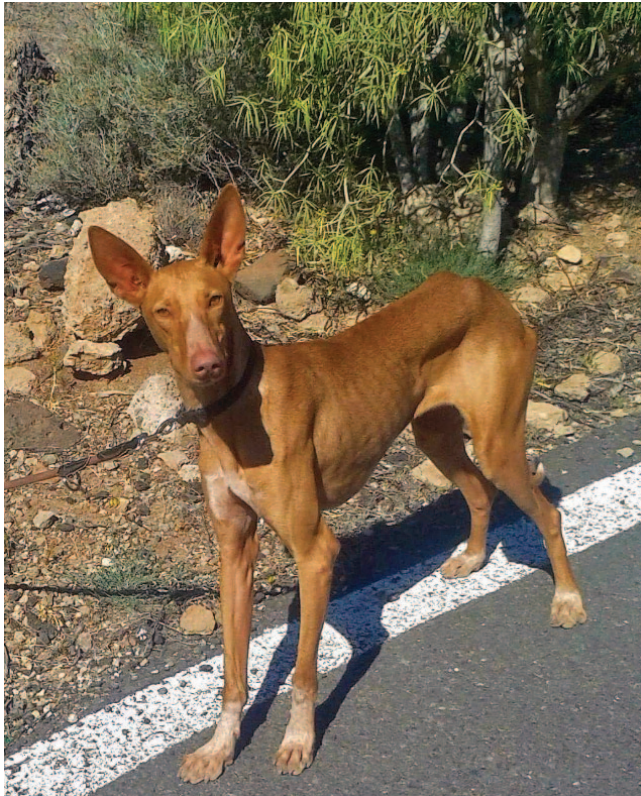
↑ The lovely Esperanza is waiting at K9 for a new home